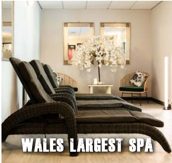
WALES LARGEST SPA