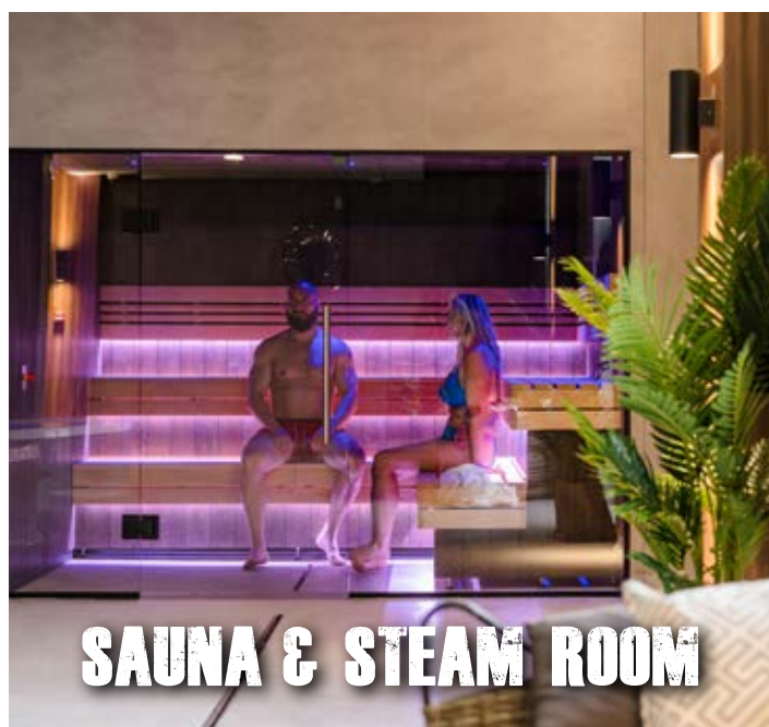
SAUNA & STEAM ROOM