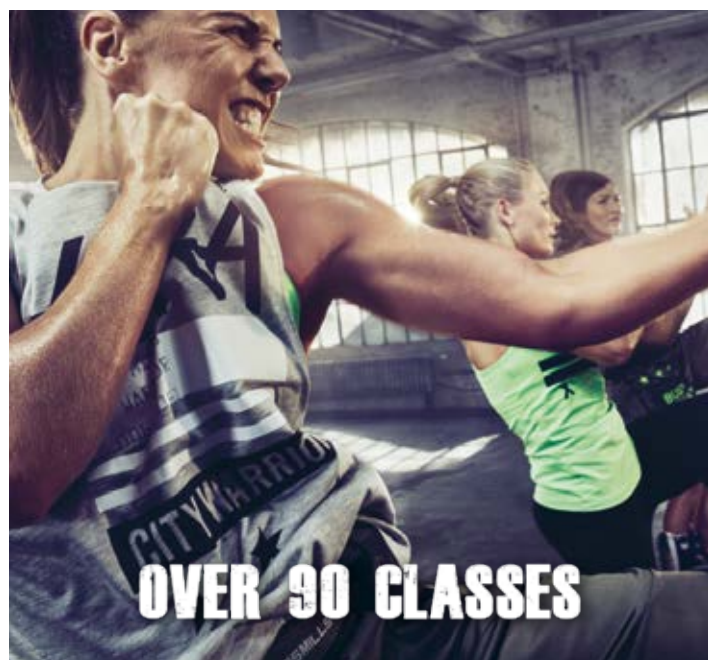
OVER 90 CLASSES