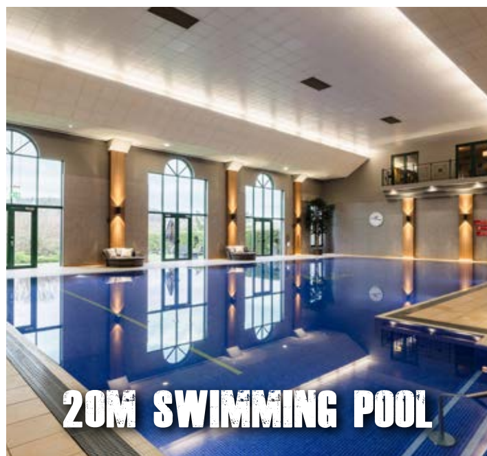
20M SWIMMING POOL