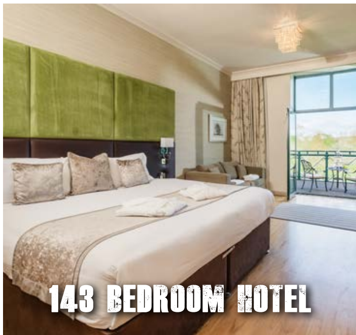
143 BEDROOM HOTEL