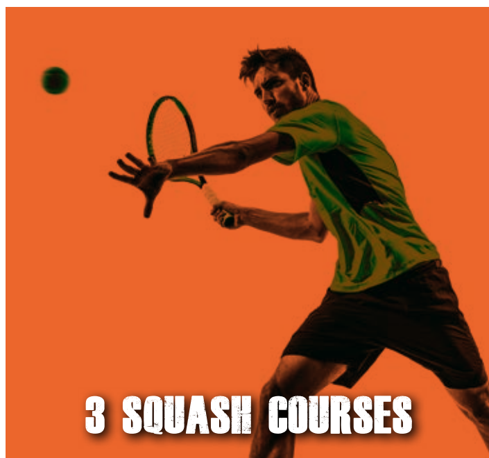
3 SQUASH COURSES