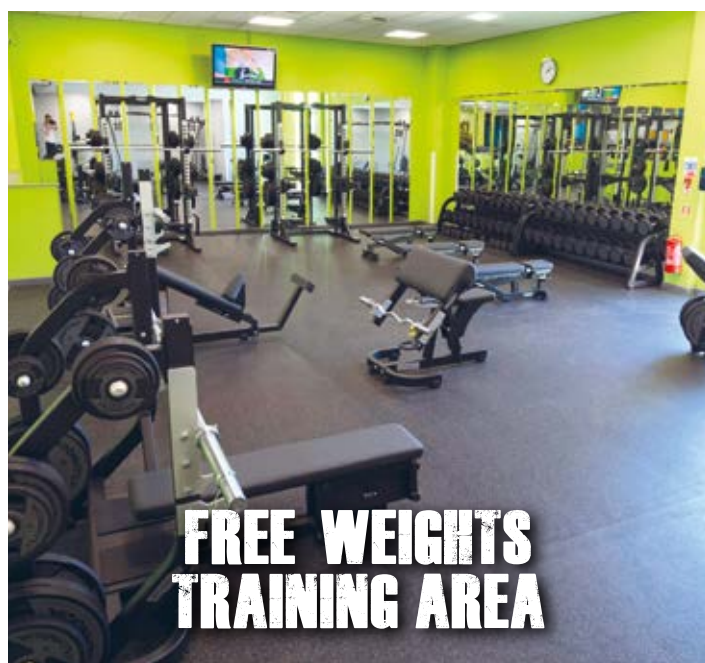
FREE WEIGHTS TRAINING AREA