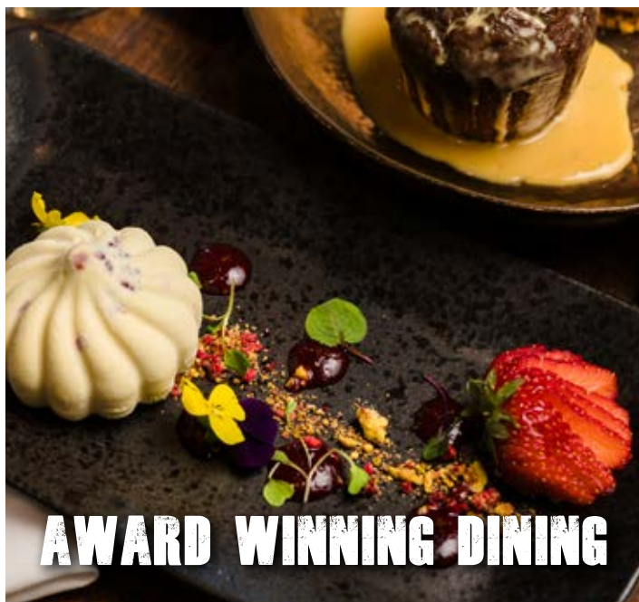
AWARD WINNING DINING