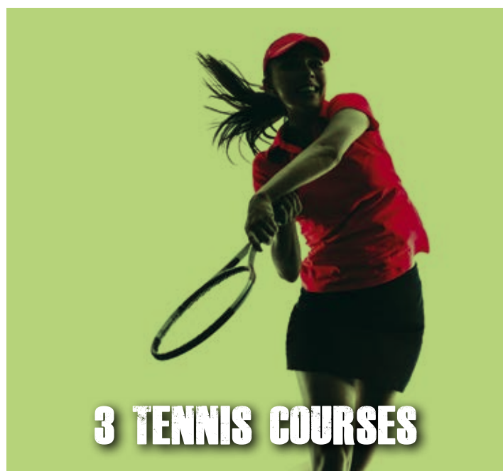
3 TENNIS COURSES